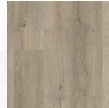
Devotion LFR2284EIR (Moderate Shade Variation)