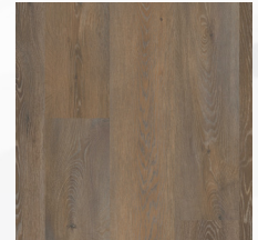
Tribute LFR71840VL (Moderate Shade Variation)

Samples are intended to be a reference for product visuals and may not represent all color, shade, pattern, and texture variations. Actual product may differ from small swatches, printed media, or digital computer images.