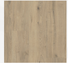
Citizen BRLT84L630VL (Moderate Shade Variation)